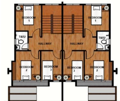
GROUND FLOOR PLAN SECOND FLOOR PLAN

The Developer shall exert all efforts to conform to the specifications specified herein. However the Developer reserves the right to alter plans, as deemed necessary, in the best interest of the product and the client.